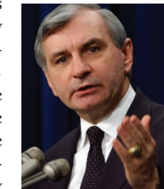
Sen. Reed, RI