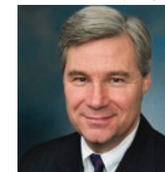
Sen. Whitehouse, RI

Please consider asking your family, associates, and friends to immediately log on to www.senate.gov and www.house.gov and email your senators and congressmen to stop this pending 21.2% cut. Physician reimbursements have not kept up with inflation over the past 5 years. This cut would create real problems, forcing some physicians to curtail acceptance of new Medicare patients and to cut staff.