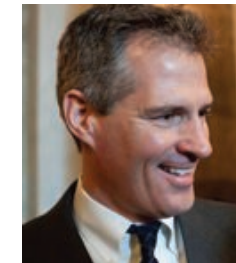
Sen. Brown, MA

Here we go again. The unfair attack on provider reimbursements looms large on the horizon. The 21.2% cut, scheduled for April 1, has been delayed by CMS until April 15, as Congressional action is awaited on this ill-advised cut.