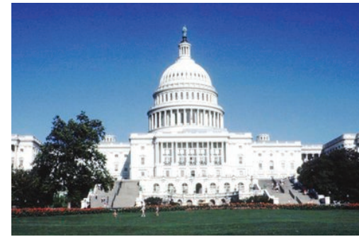
Be sure to contact your congressmen