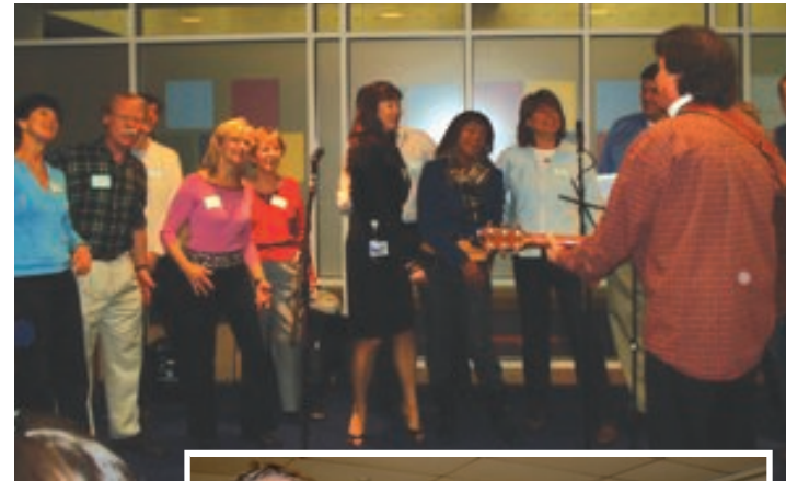
Pictured above are the Minstrels at the Shriners' Burns Hospital in Boston and, at right, the Minstrel band on March 29 at Boston's Long Island Homeless Shelter in Boston Harbor.

P.S. Care to donate to our cause? Visit bostonminstrel.org and click on "How to help." And, thank you!