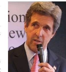
Sen. Kerry, MA